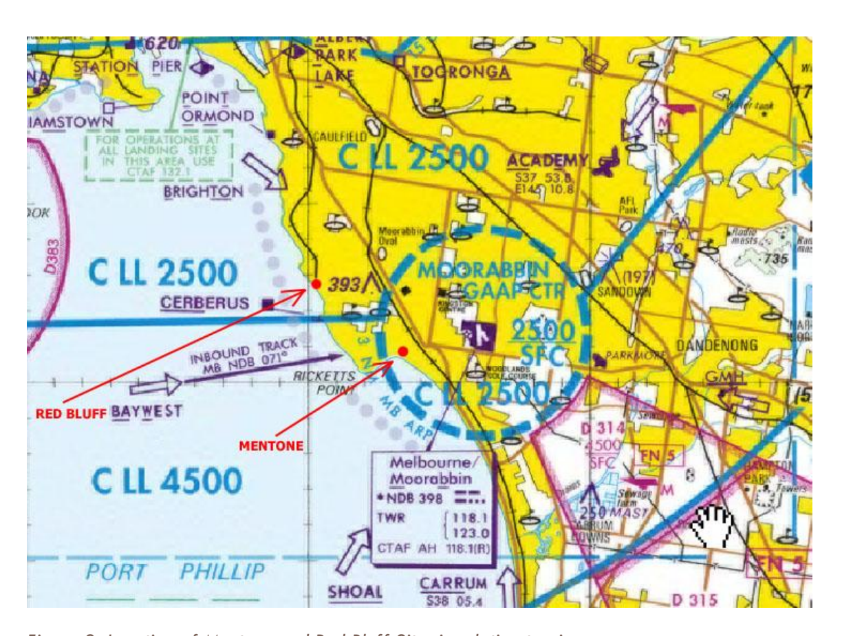
Figure 2: Location of Mentone and Red Bluff Sites in relation to airspace.