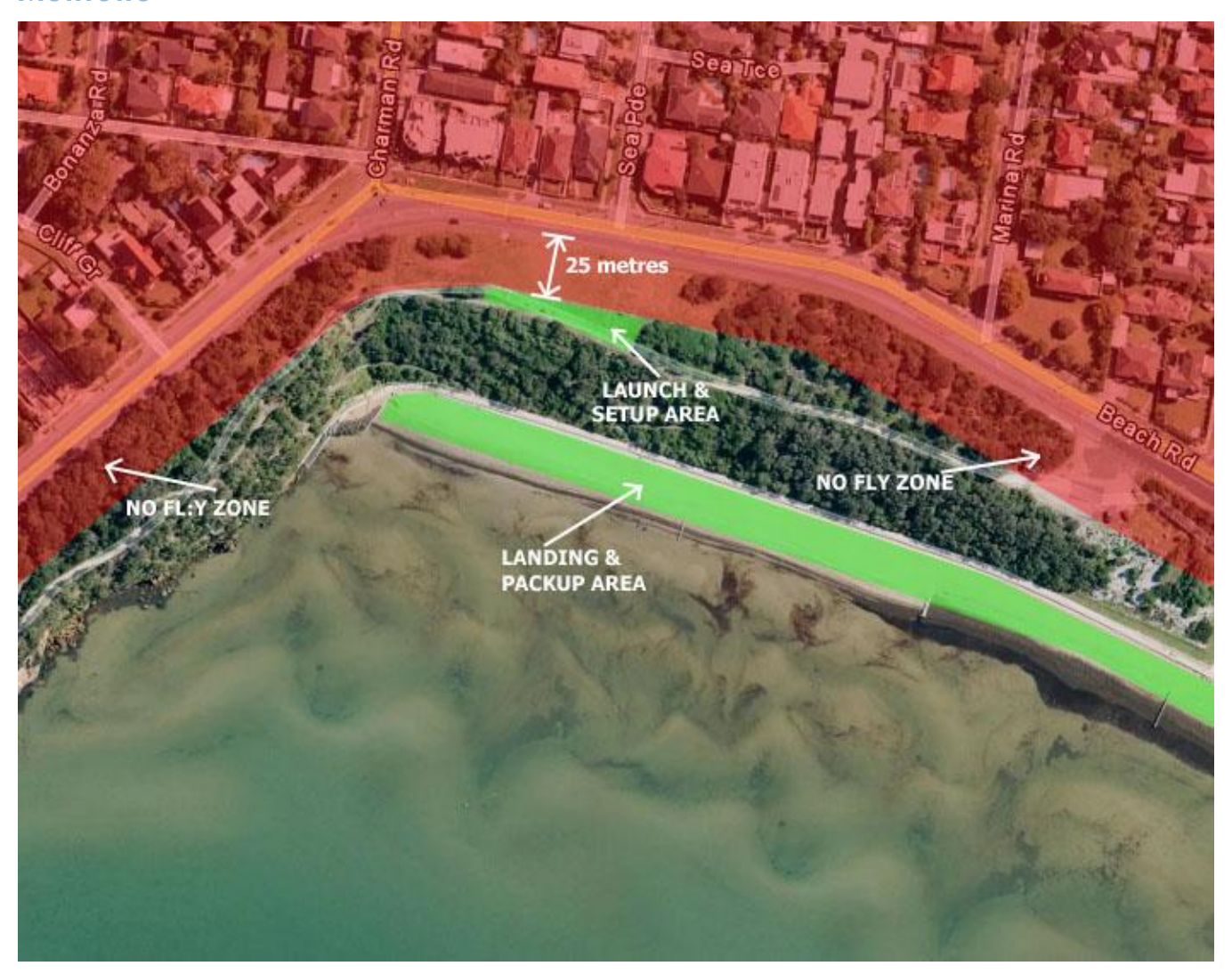
Figure 2: Red Bluff Site – indicating Launch, Landing and No Fly Zones.

Pilots at Mentone would launch from the grassy picnic area at a distance greater than 25 metres from the main road. The shaded read area indicated the "no fly" zone and constitutes the area where flying would be prohibited. The beach below launch would constitute the Landing Zone and, due its size, represents an easy and safe option.